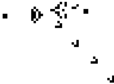
Figure 9.2: ... in action.