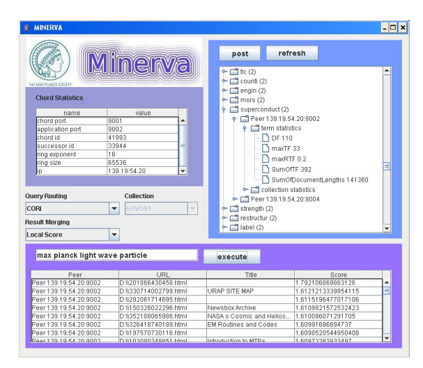
Figure 2: MINERVA GUI